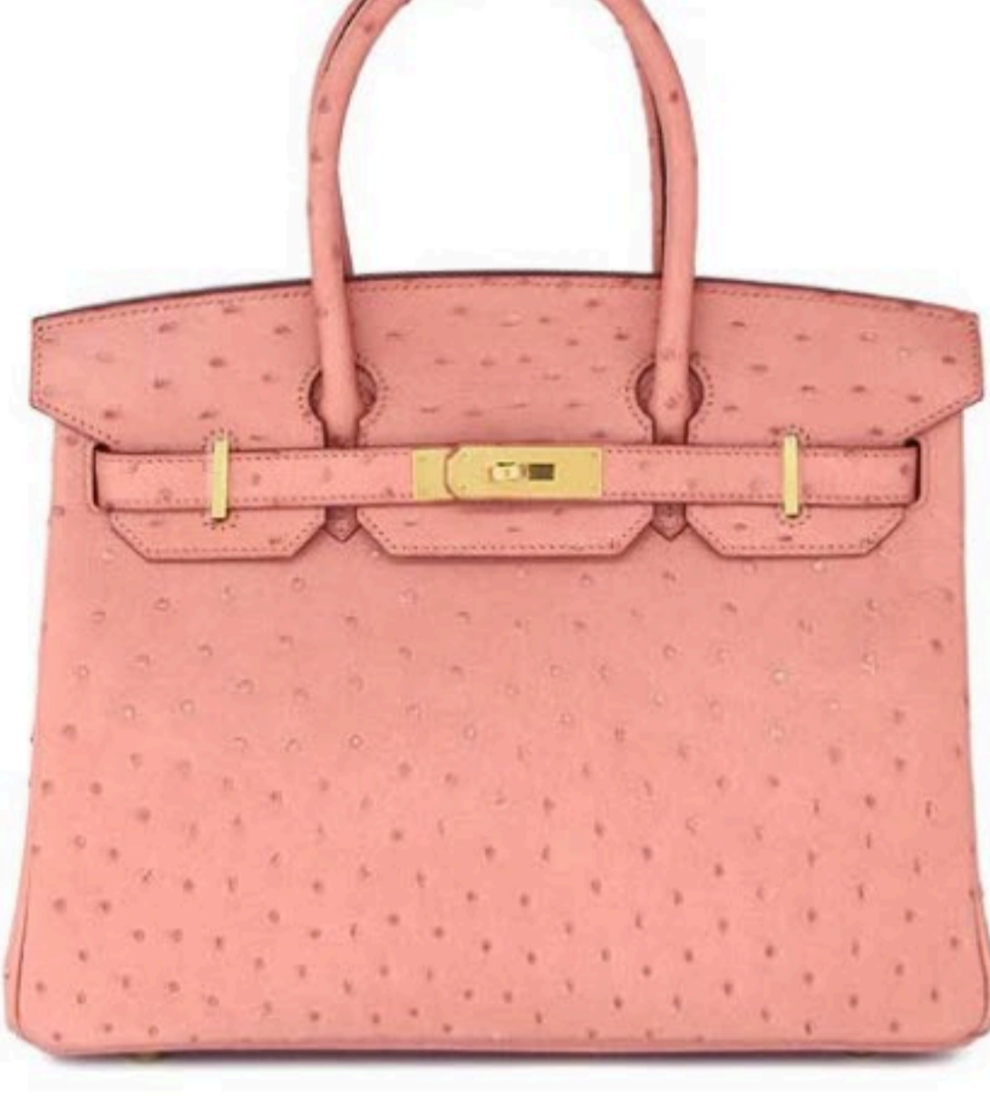
BIRKIN TERRE CUITE | Named after legendary actress Jane Birkin, each Birkin bag takes an estimated 48 hours to create with immaculate levels of skill

Ever since Thierry Hermes established The Hermes Fashion House in Paris in 1837, the Hermes brand has always been rather special. As a symbol of absolute luxury, Hermes started out as a harness making shop for the European elite. Serving royalty and noblemen alike, Hermes' early customers included the likes of Napoleon III and his wife, the last ever empress of France, Eugénie de Montijo. While plenty has changed since those days, the fact still remains that owning a Hermes product is something we all aspire for. With their expertly crafted bags sometimes requiring a five-year waiting list, their demand is as high as ever. Read our guide below to find out which Hermes bag is perfect for you: