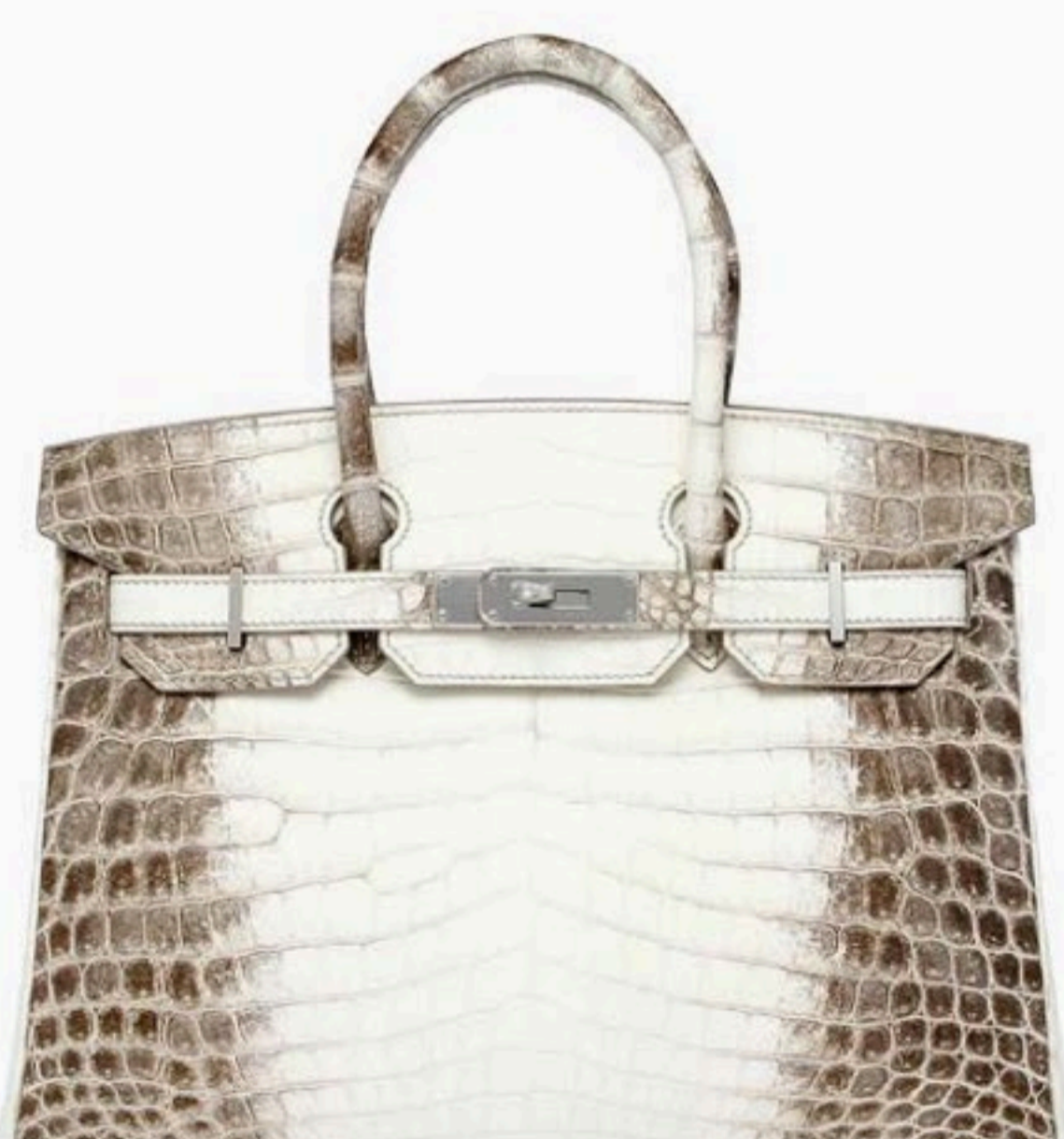
HERMES BIRKIN HIMALAYA | The Birkin is one of the most coveted of Hermes bags and notoriously difficult to get