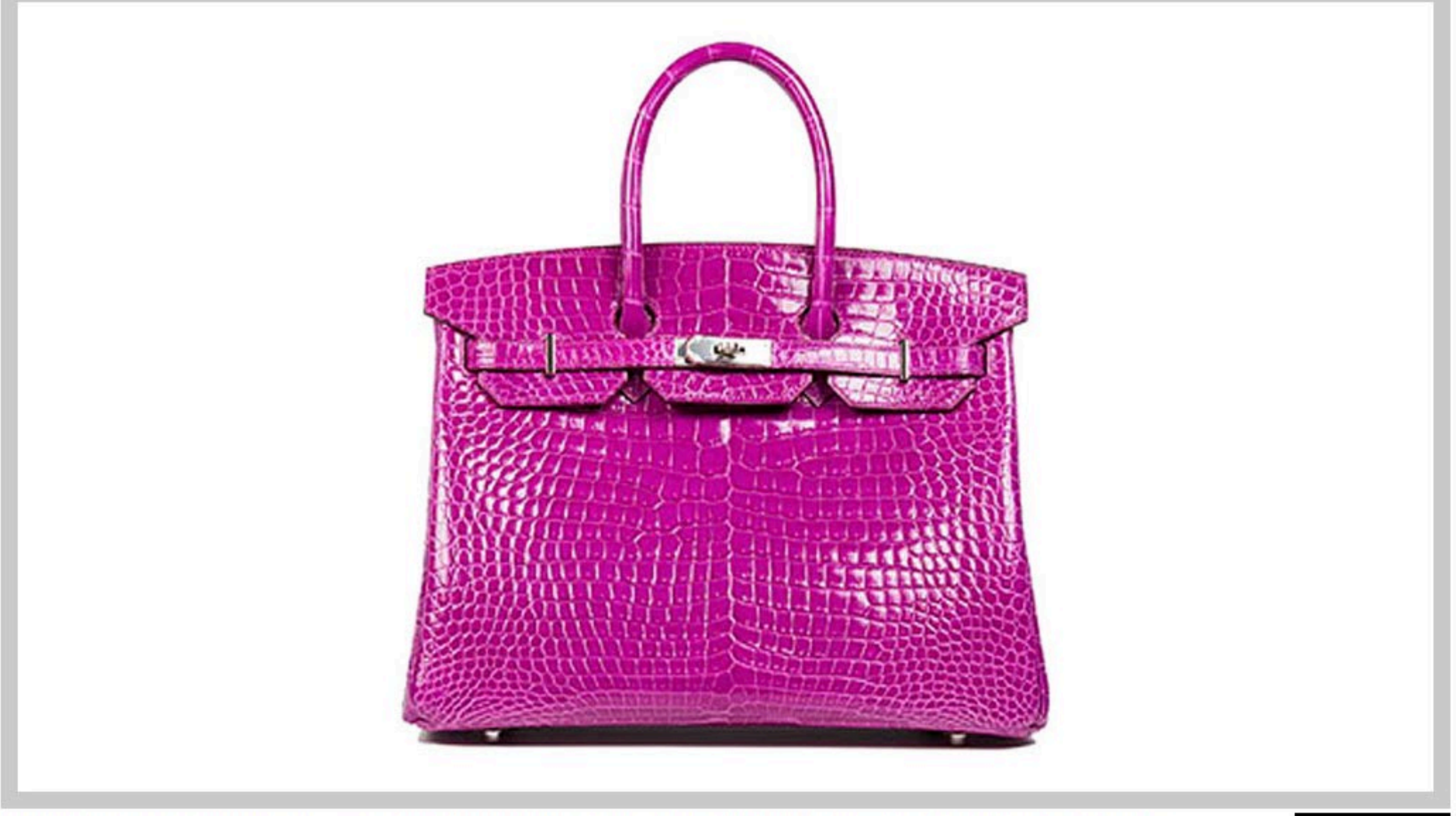
FIT FOR A QUEEN | With early customers like Napoleon III's wife, the last empress of France, this bag is literally made for royalty. Seen here is the Birkin Sheherazade LOVE

A symbol of absolute luxury, the Hermes bag is an indispensable part of the modern diva's style-file. Here's a detailed guide to picking your very own Hermes, complete with the juicy tales behind each of these original creations, things that distinguish a Birkin from a Kelly, making each one unique