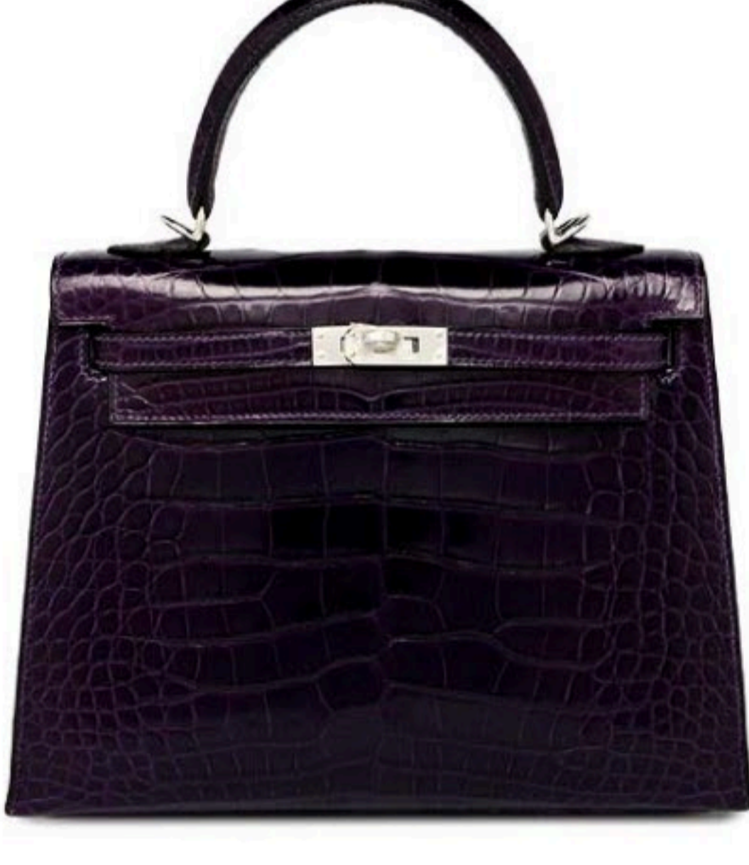
KELLY AMETHYSTE | The Kelly is a timeless classic for you to flaunt at a high profile event

Requiring similar levels of time and precision to craft the Hermes Kelly bag was first conceived in 1892 and known by its original name Sac à Dépêches. The bag was popularised by actress Grace Kelly, who fell in love with this bag and used it to shield her pregnancy from the paparazzi in 1956. The bag was subsequently named Kelly in her honour in 1977 and exudes fine sophistication.