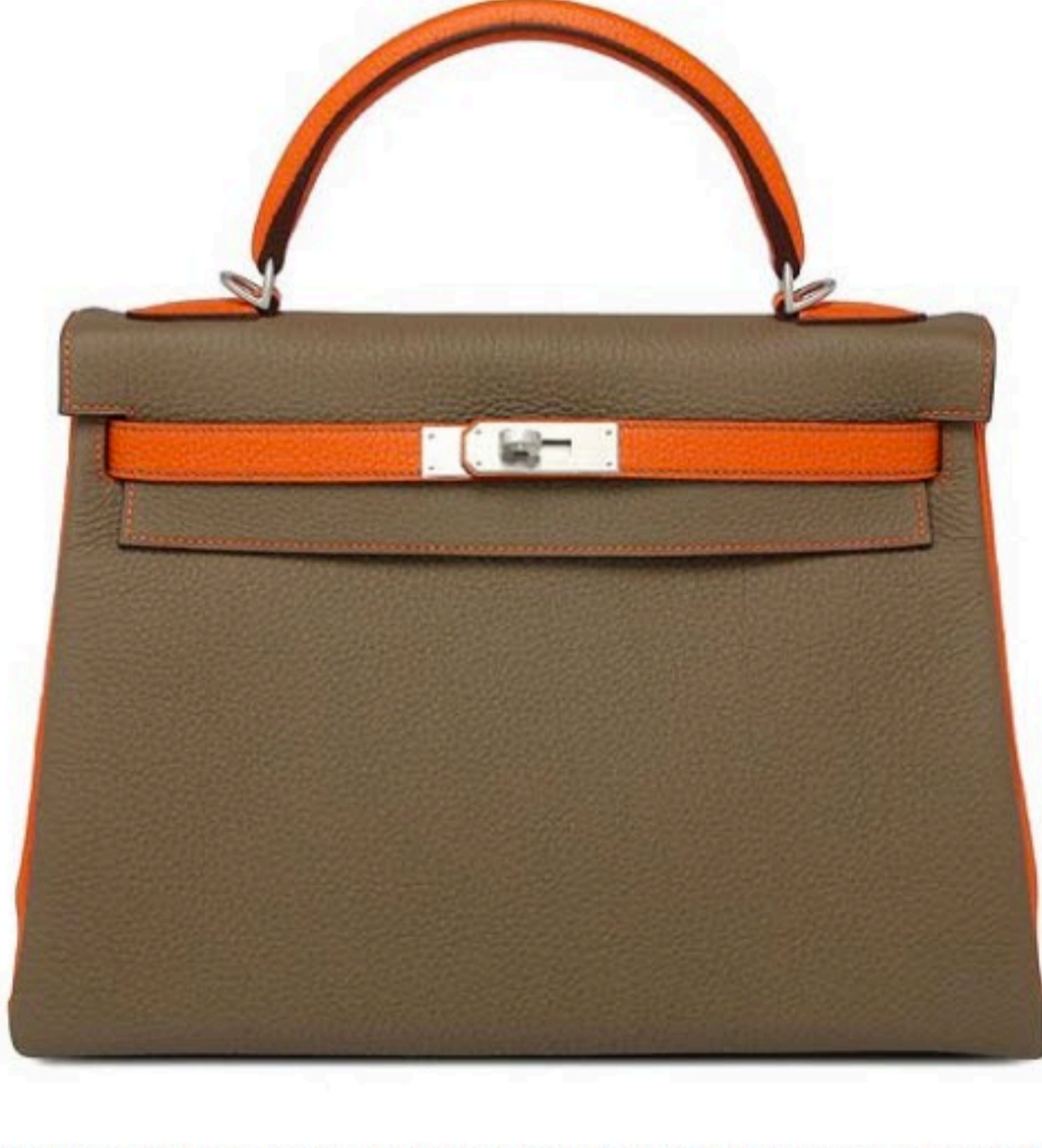
KELLY ORANGE | The Hermes Kelly bag was popularised by actress Grace Kelly, who used it to shield her pregnancy from the paparazzi in 1956

The jewel of the Hermes crown, the Birkin bag is one of the most iconic handbags ever made. Being seen with this bag demonstrates luxurious wealth, making the demand for this bag soar, so obtaining a Hermes Birkin is notoriously difficult. The bag itself is named after legendary actress Jane Birkin who inspired its creation having spoken of a need for a leather weekend bag to Hermes' chief executive Jean-Louis Dumas whilst on a flight to London in 1981. The Hermes Birkin is easily recognisable by its two rolled leather handles which are carried in the fold of the arm and its lock and key, with the key being enclosed in a leather holder known as a clochette. Available in sizes ranging from 25cm to 40cm, the Birkin is wide and spacious and functions perfectly as an open tote bag, ideal for global jet-setters that want to travel in style. Such is Hermes' dedication to quality, each Birkin bag takes an estimated 48 hours to create requiring immaculate levels of skill, precision and care by Hermes' expert artisans.