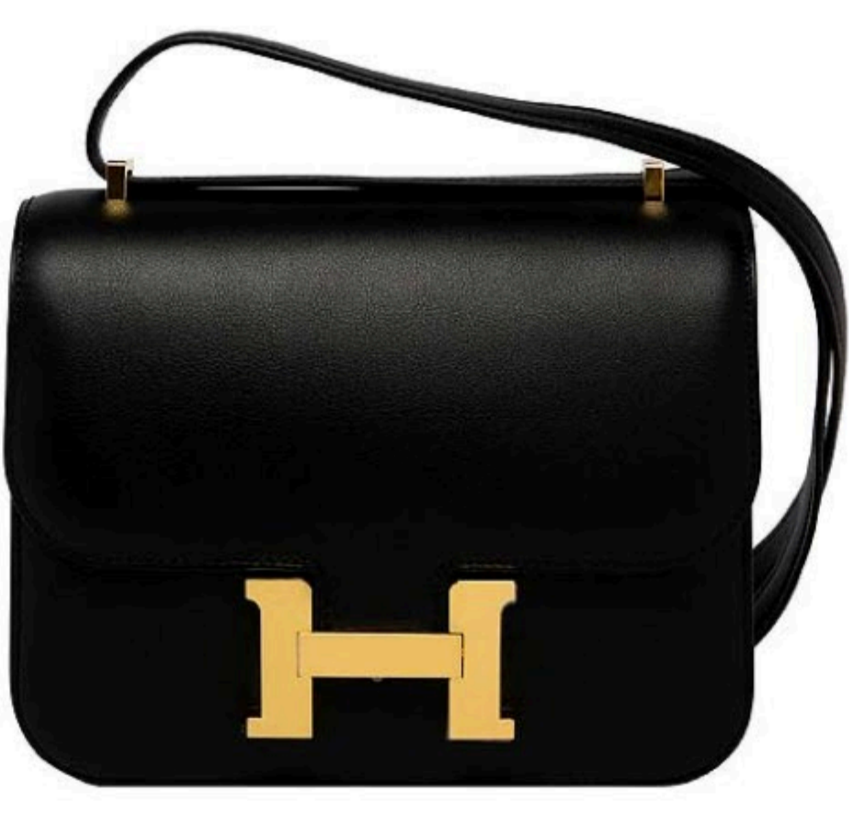
CONSTANCE BLACK | A personal favourite of Jacqueline Kennedy, the Constance bag is best known for its signature 'H' clasp on its flap closure

Suited for more formal occasions than the Birkin, the Kelly is of a firmer, trapezium shape that holds its shape well, being able to stand freely. Identifiable by its single handle, the Kelly also features a detachable shoulder strap to enable free carrying as well. A timeless classic, the Hermes Kelly bag is ideal those wishing to effortlessly exude elegant chic at any high profile event.